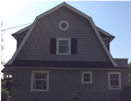
Our House (side view)